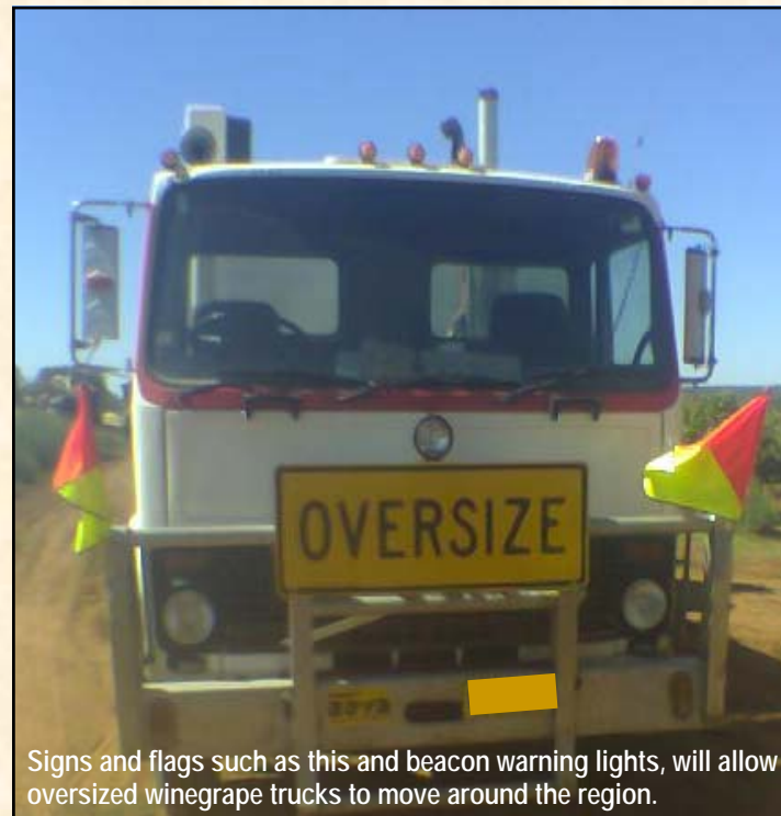
Signs and flags such as this and beacon warning lights, will allow oversized winegrape trucks to move around the region.

To obtain the extension the Board has been asked on behalf of industry to provide a written undertaking that all conversions will be completed by the 2008 harvest.